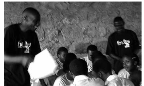
Makena students work on a group project during "Fun Day 2008."